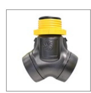
Y-Connector Is used for 2 filter operation of the Smartblower PAPR.