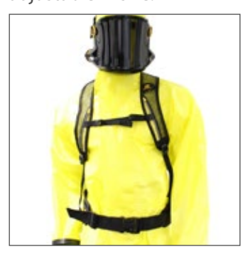
Bayonet locking Attachment for Y-Connector and swivel joint to adjust the

The straps are made out of breathable material and are adjustable in size.