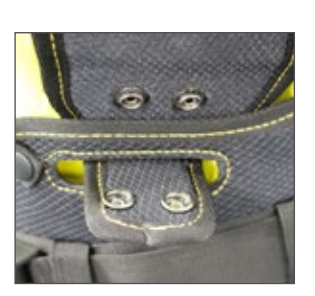
Safety press-studs Enables easy adjustment of various wearing positions.